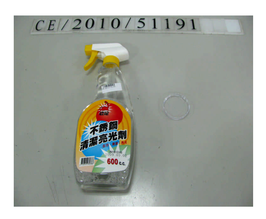
** 報告結尾(End of Report) **

NO. 25, 23 ROAD, INDUSTRIAL PARK, TAICHUNG 408, TAIWAN